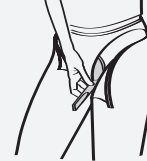
4. Using the Whiz without undressing

Important: The Whiz® must be held correctly. The broad area of the opening must be uppermost and held snugly against the body. Its unique lily shape was tested by over 1,400 women in clinical trials and since used successfully by many thousands of women of all ages, from all walks of life. Held correctly the Whiz will not leak and stays completely dry on the exterior. Remember to keep the nozzle pointed downward and away from the body. Do not share a Whiz with others.