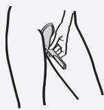
1. Hold the Whiz snugly against the body as shown

You will be amazed at what difference such a small device can make to your quality of life.